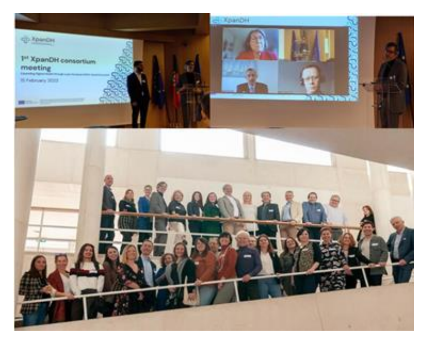
XpanDH Consortium in Lisbon, Portugal

ISCTE Knowledge and Innovation Centre, together with 25 other European partners, launched the most recent European-funded project, "XpanDH: Expanding Digital Health through a pan-European EHRxFbased Ecosystem" in Lisbon, Portugal. The in-person gathering of research organisations, businesses and intergovernmental and multistakeholder associations marks the consortium's grand undertaking to mobilise and build individuals and organisations' capacity to create, adapt and explore the purposeful use of interoperable digital health solutions based on a shared adoption of the European Electronic Health Record Exchange format (EEHRxF).